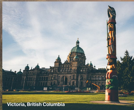
Victoria, British Columbia