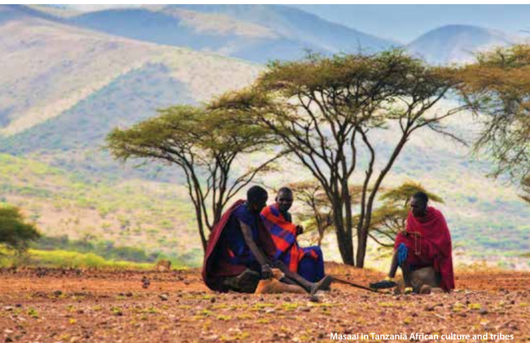
Masaai in Tanzania African culture and tribes

For more information, please contact uia@uia.org