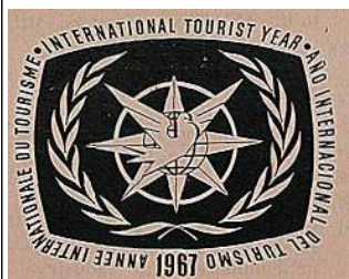
Emblem of the International Tourist Year.

• Année internationale : 1967 a été désigné par le Conseil économique et social des Nations Unies comme Année internationale du tourisme. La XIX e Assemblée générale de l'Union Internationale